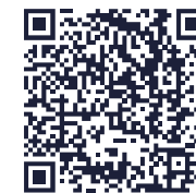
MANGO POWER App